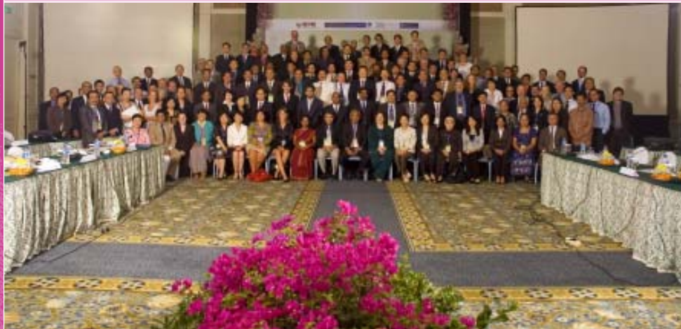
Delegates of the ADB/OECD Steering Group Meeting