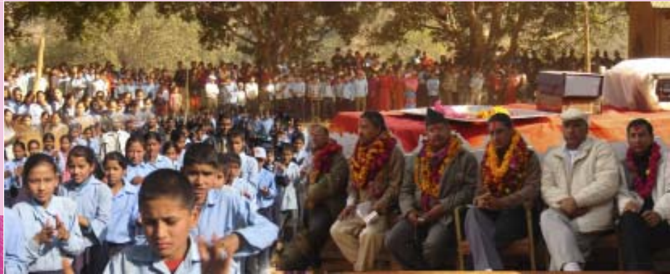
CIAA Secretary in an Intraction Program held in Ramechhap District