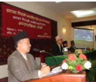
Speaker of Interim Legislative Parliament Mr. Nembang Addressing the Interaction Program

Those who hold constitutional position and are subject to impeachment, shall be dealt with by the Impeachment Act. Those who are judges in courts other than the Supreme Court, are to be dealt with by the Judicial Council. The officials of the court are, however, under CIAA's jurisdiction.