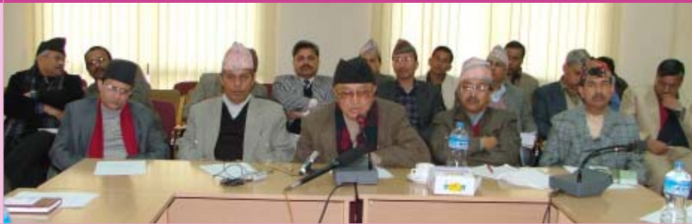
Interaction with the Chief Secretary and Secretaries