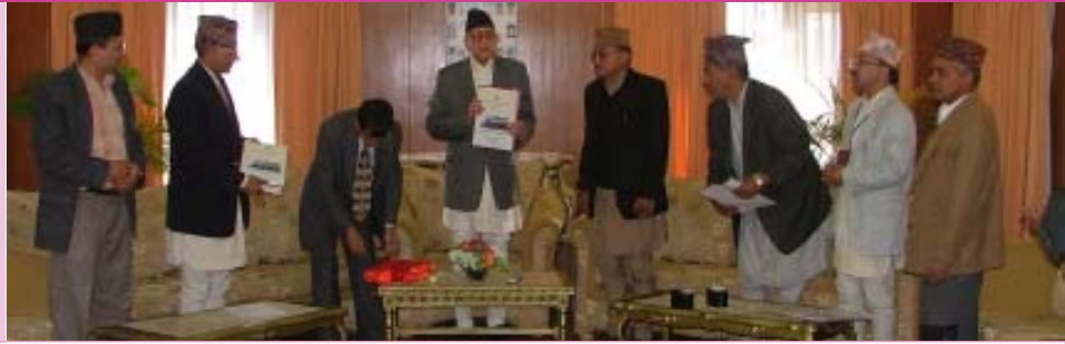
Prime Minister Mr. Girija P. Koirala Receiving the Annual Report of CIAA