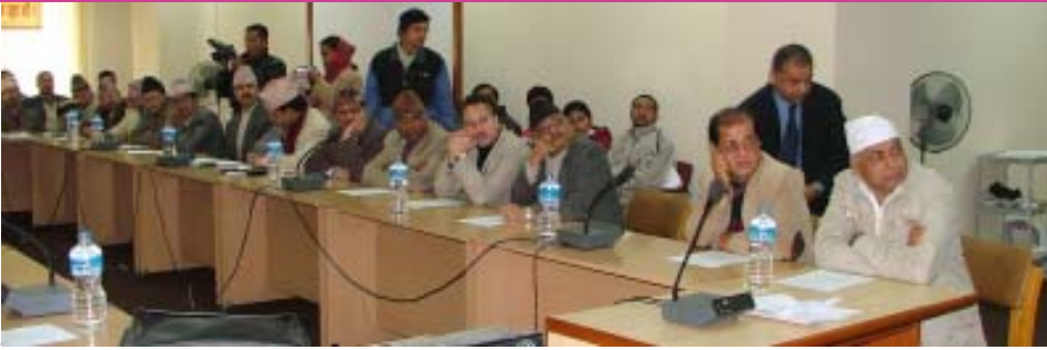
Government Secretaries in an Interaction Program